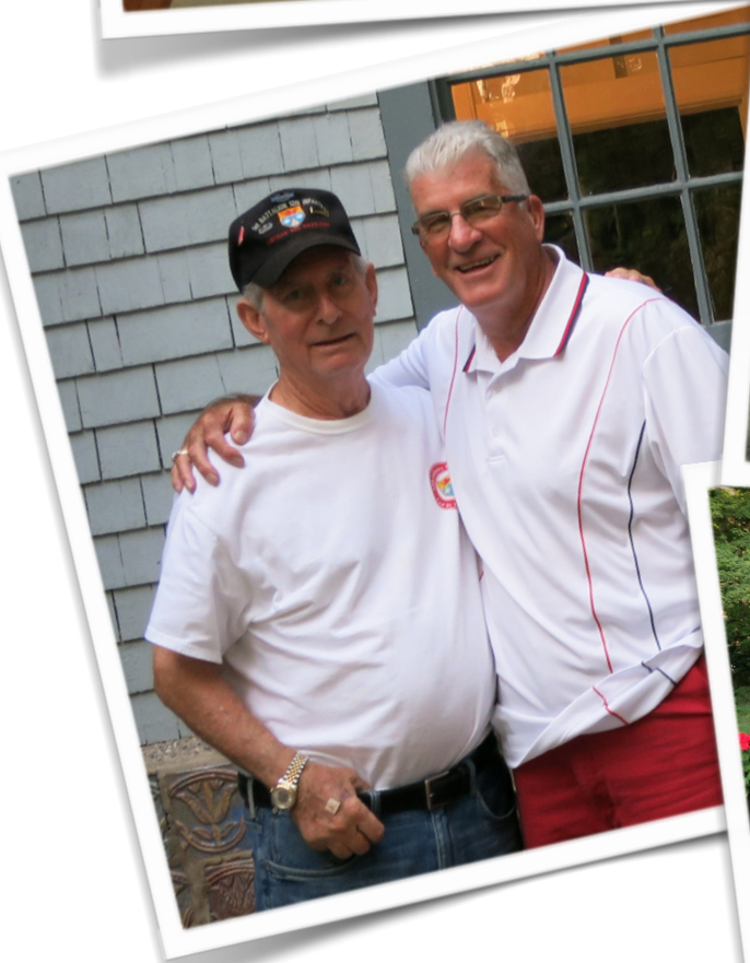
Lots of time for renewing friendships, grilling steaks, and enjoying each others company