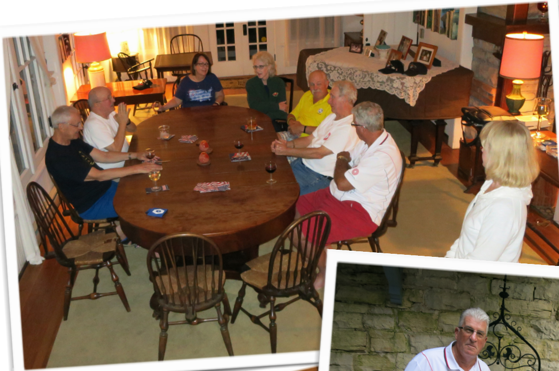
Accommodations - looks like the group had a great place to stay. Here a little relaxation in the evening with a glass of wine easily at hand.